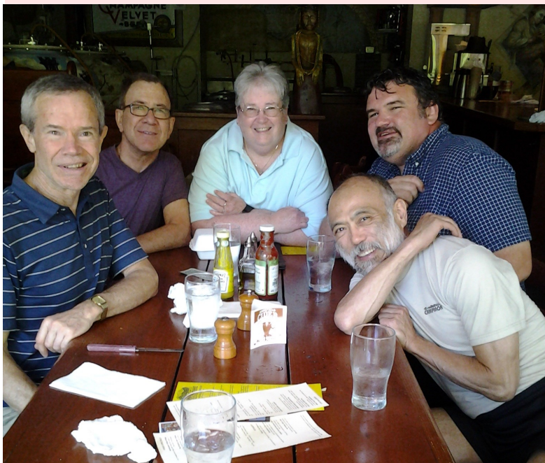
Spring Quarter Celebration: June 4 at McMenamins at Lower Queen Anne.