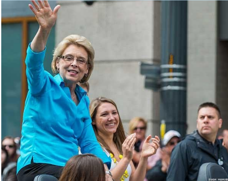
← Parade Grand Marshal, Washington Governor Christine Gregoire